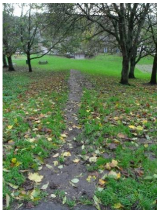
Figure 2 View from Jubilee Steps