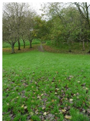
Figure 3 View from entrance at St James