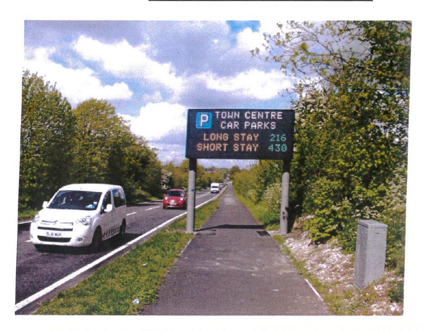
Appendix B. Sign Examples <u>Variable Message Sign Examples</u>