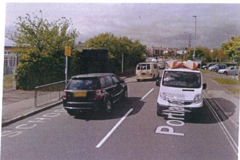
Portland Road, Weymouth.