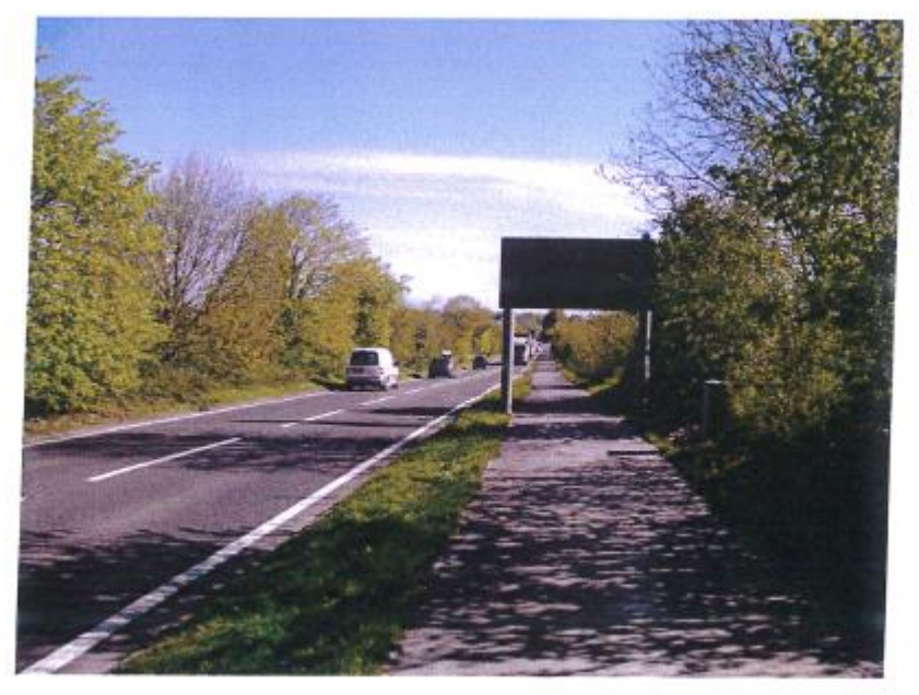
Monkton Hill, Dorchester.