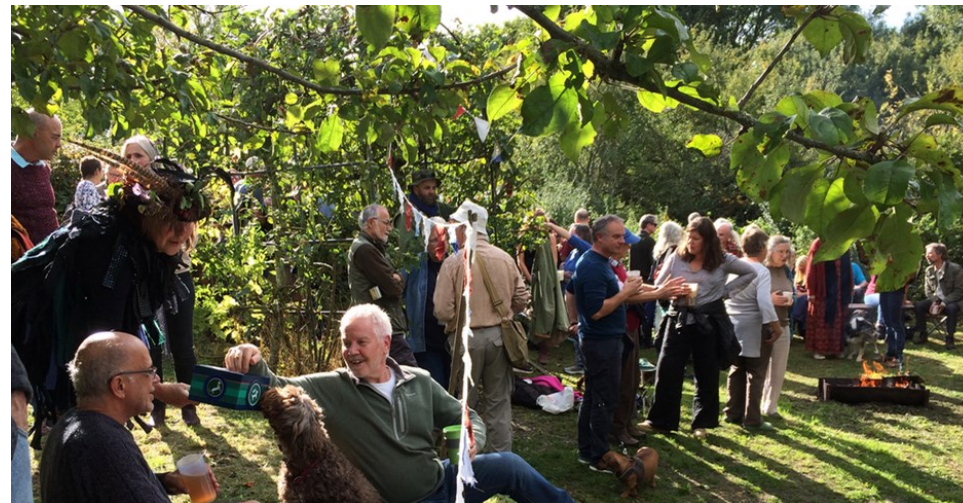
Donkey Field Apple Day

figs filberts gages gooseberries grapes pears plums quinces walnuts