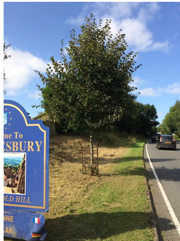
A350 South 2024

When mature, these trees will become landmarks, marking our green credentials and adding to the town's local distinctiveness. Our aim is to plant at least one pair of trees with tree-guards at other parish/county boundary locations each year as appropriate and/or possible (see Note a ).