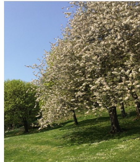
Wild Cherries in the Park

Orchard Town aims to help provide Shaftesbury residents with increased local and home-grown food from fruit trees in private gardens, public areas, workplaces, schools, places of worship.