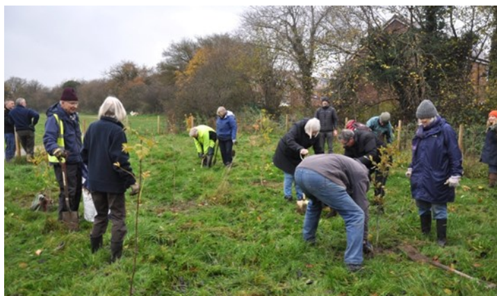
Wincombe Park planting

In January 2023, Shaftesbury Tree Group (STG) volunteers completed a programme of tree and hedge planting on town council land with approximately 80 trees planted and many metres of hedges. Most of the trees planted have survived but for logistical reasons not enough water was able to be provided to many hedges and some were flailed inadvertently.