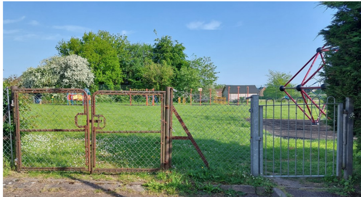
Above: entrances 1 (pedestrian) and 2 (maintenance access)