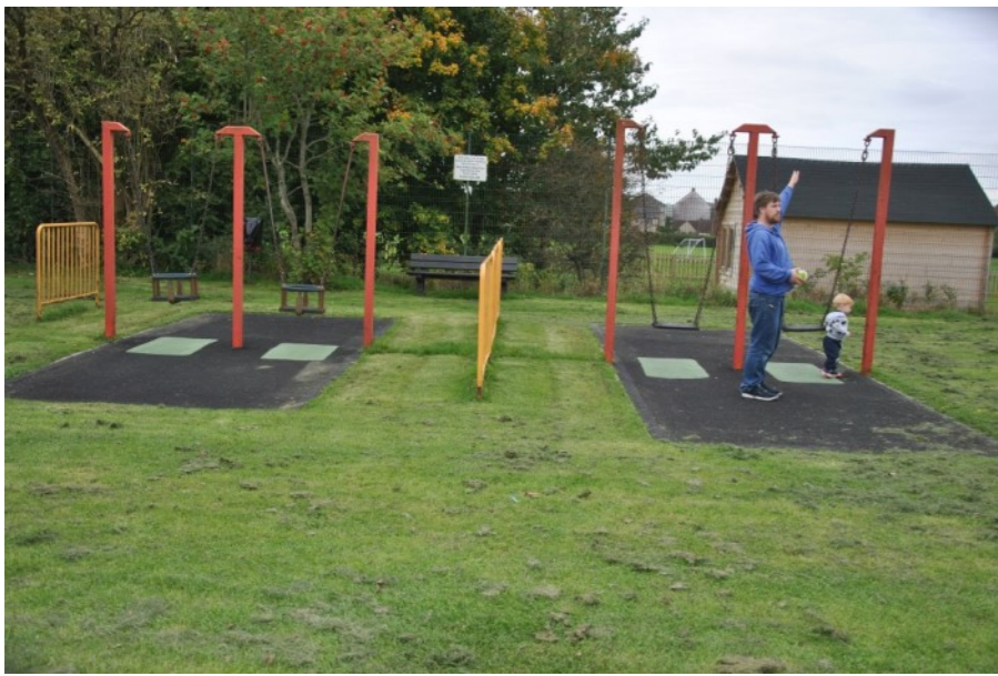
Location for new Basket Swing