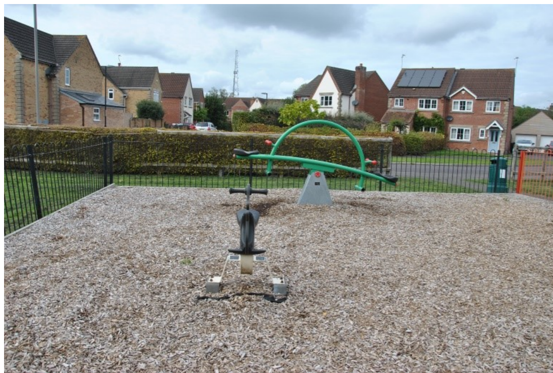
Top: elephant piece to be removed and disposed of, green space beyond shows the treeline along which the equipment will be relocated