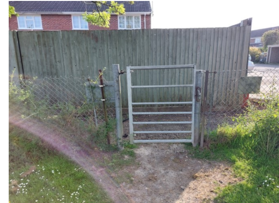
Left: entrance 4