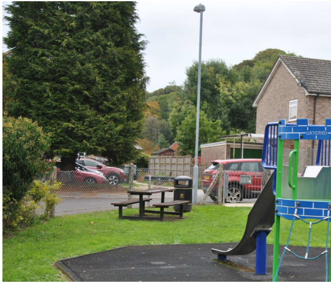
Top: barriers to be removed and surfaces to be made good