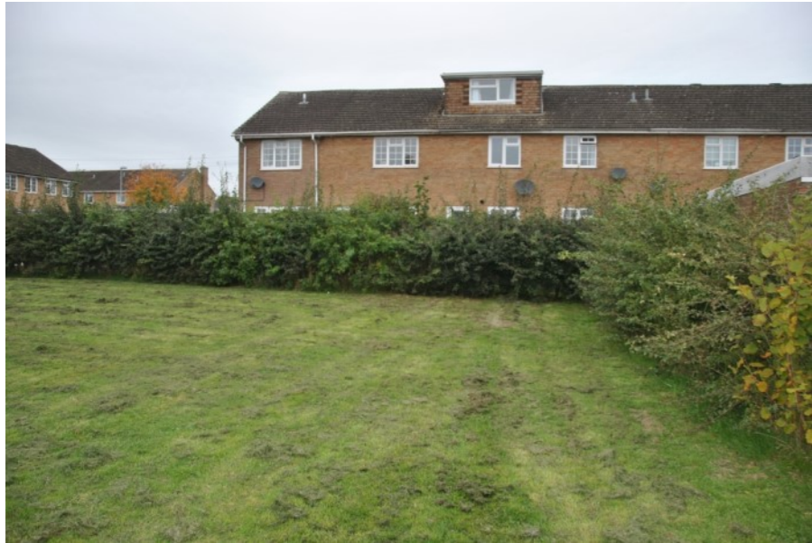
Location for seating etc