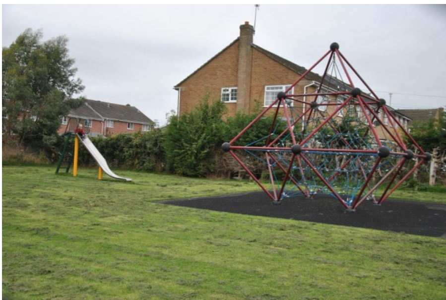
Location for new Dutch Disc and Mounds A+B