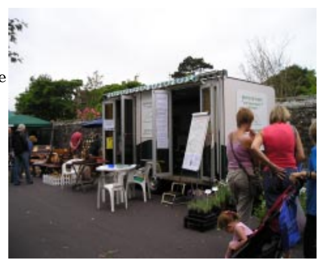
Gold Hill Fair 2005

All the documents and reports that form the evidence base of the CSP are available for inspection at the Task Force offices, Longmead, Shaftesbury.