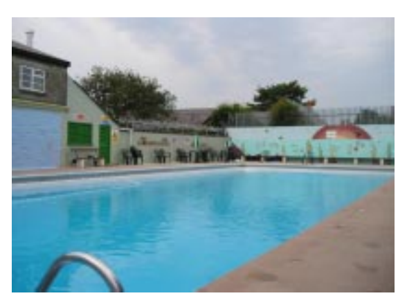
Shaftesbury Swimming Pool

While Shaftesbury has many areas of attractive and accessible open spaces, opportunities for more formal recreational activities are limited and provision for teenagers, both formal and informal, is particularly limited. In addition, the lack or inconsistency of public transport makes it difficult or impos-