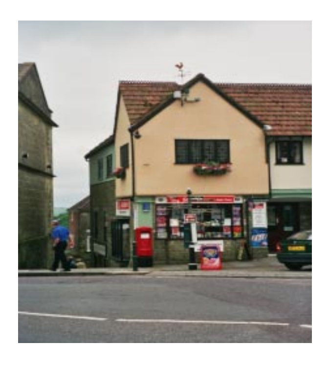
Entrance to Gold Hill

The Action Plan supports the objectives within the SDCC's 'Policy and Strategy Statement 2005-2020' and will work to assist the SDCC in developing schemes and initiatives which forward and help to realise these economic objectives.