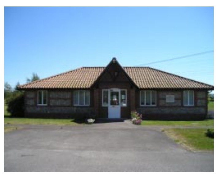
Fontmell Magna Surgery