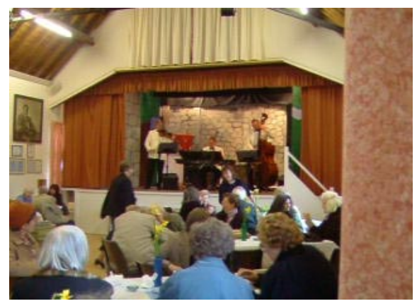
'We'll Est Again' - Motcombe