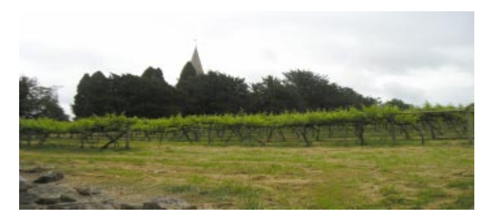
Fonthill Gifford Vineyard

Concerns were expressed throughout the consultation process about the future of farming in the area. Nearly 6% of the local workforce is in agriculture and the Action Plan supports the principle that the industry has a continuing role to play in maintaining the countryside on which much of the area's appeal and tourism economy relies.