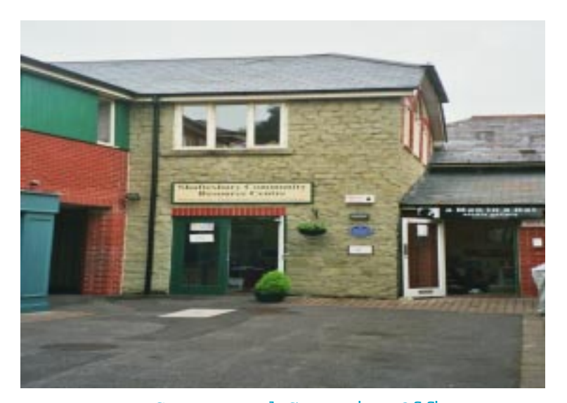
Swans Yard Community Office

facilitator for all local people and community groups. This will enable them to come together to have a voice in decision-making in strategic partnerships across Shaftesbury area and, in particular, assist them to secure appropriate resources to develop their own structures and projects.